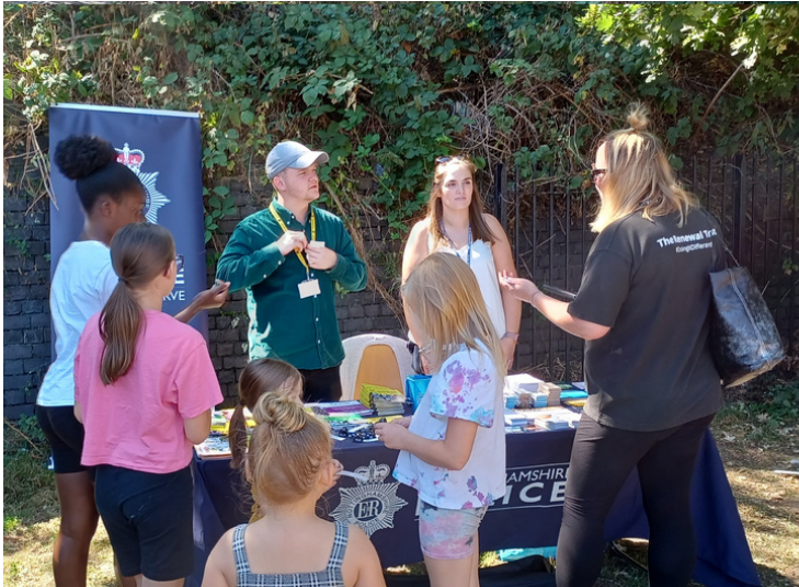
Victim CARE & Nottinghamshire Police in Sneinton.

If you or someone you know needs support - call us on: 0800 304 7575