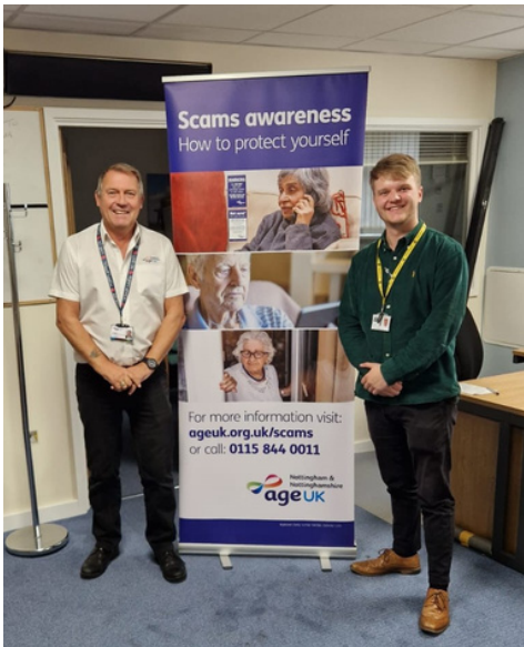
Victim CARE & Age UK Scams Team.