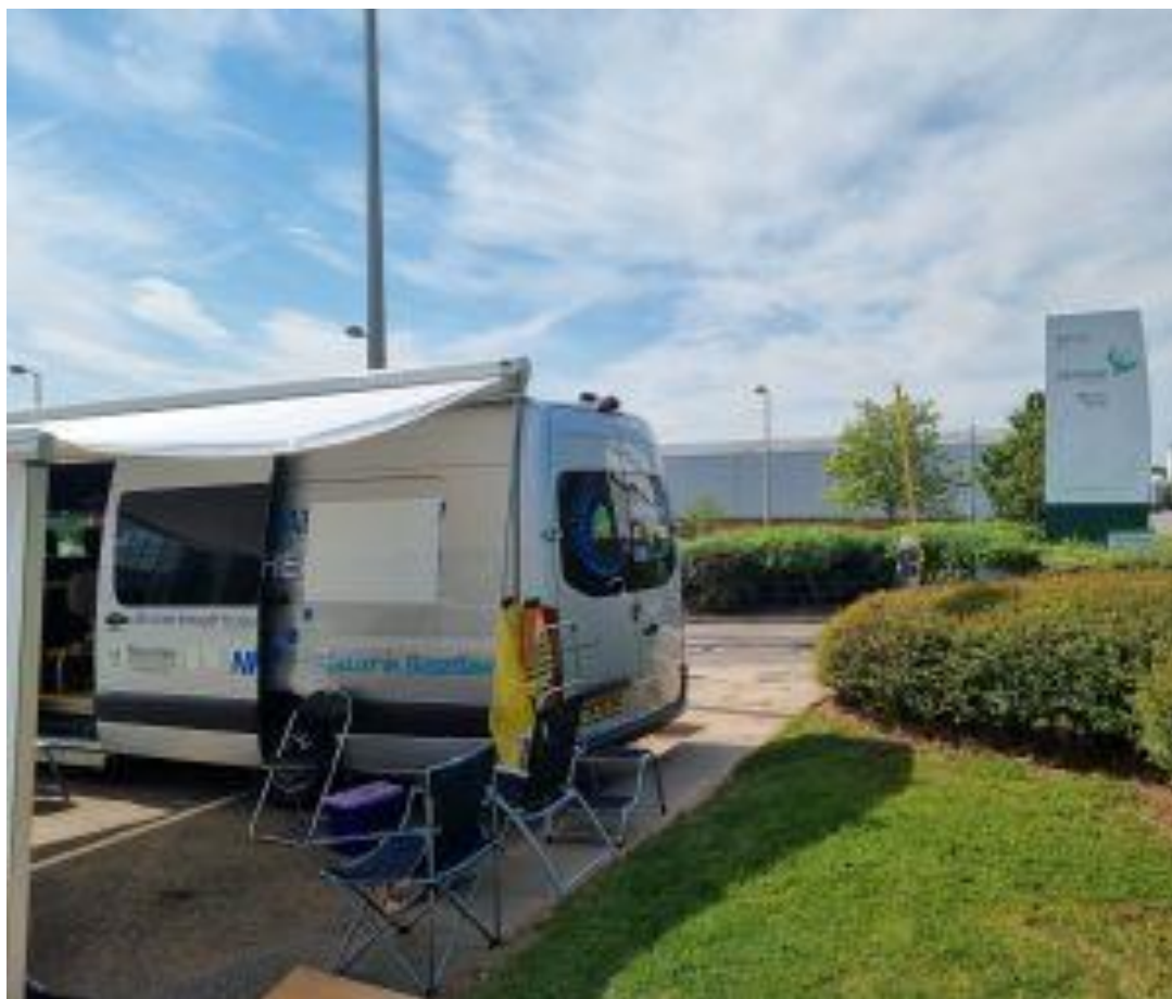
Bassetlaw Health Bus

This work has fed into new group development work and into local health campaigns to support better understanding of the barriers experienced by local Eastern European minority ethnic communities in Bassetlaw.