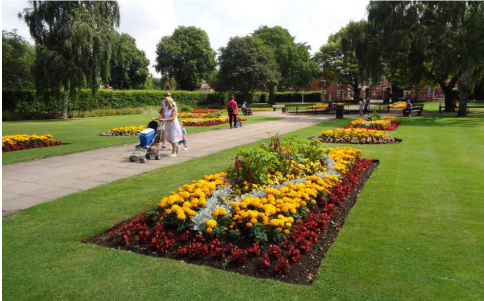
Kings Park, Retford

Local information and advice on living in the area